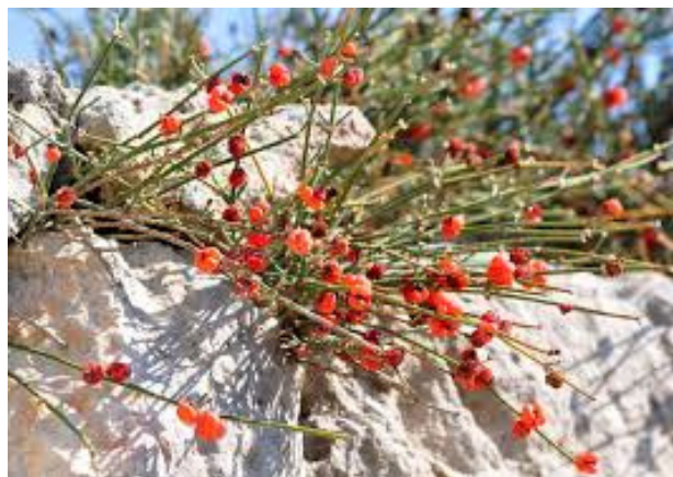
Figure 1. Ephedra Distachya L.

Scientific name: Ephedra distachya L. (Figure 1); English name: Sea grape, Sand cherry; French name: Ephe`dra, Raisin de mer; Italian name: Uva di mortra; Arabic name: Alad; and Persian name: Goat's beard, Armak, Hoom (5).